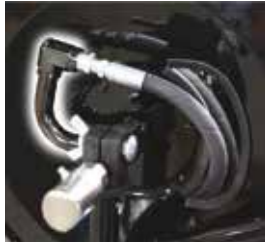
New Non-Kink Hose Attachment